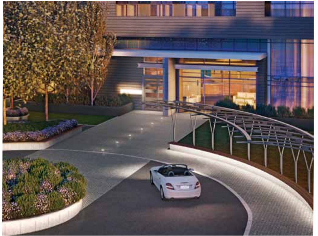
Make a grand entrance at The Station.

With all these strong indicators that suggest that now is the time to buy, naturally, the next question is where to invest your hard-earned money. Once you have decided to purchase a condo, the next essential attribute to consider is location. The right location will make a condo more desirable and allow for greater appreciation over time. Ideally, you need to look at a location that commands a brisk velocity of new home sales and demonstrates healthy resale values. Another key is to invest in a home located in an area that shows potential - one that is on the upswing. If you can get in before an area becomes recognizably popular, you'll be able to capitalize on future potential, without the hefty sticker price. The Station is perfectly located along the rapidly gentrifying Wilson Avenue, surrounded by resale homes that command a healthy value on the market. Part of the City of Toronto's Avenues Initiative, this condo is located in a neighbourhood that is set to continue sustainable and residential-friendly development.