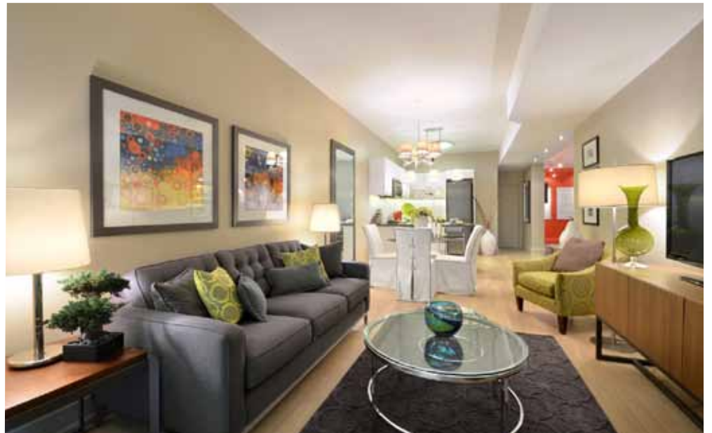
Tour our modeled living space today.

Feel free to visit our Sales Office and tour the living space we've modeled to show you our features and finishes. Our interior designer, Terrence Lukas of Lukas Design Interiors, uses distinctive colour accents and patterns to make the space feel bright and inviting. It might inspire you to give some thought to how you can also brighten up your home. Pick a colour you like and start small. Wander your local home furnishing store and check out what they have. You might be surprised at how much difference a little change can make in creating a space that you love.